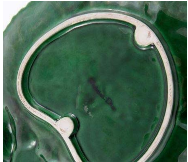
Christian Dior makers mark