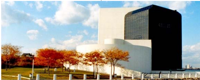
John F. Kennedy Library and Museum open daily

Wow, what an opportunity while you're in Boston! Think about a visit to the John F. Kennedy Library and Museum. We have put some free time in the schedule and you could come early or stay in Boston late. Think what you can see!!!!