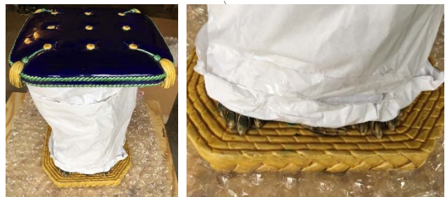
The top pillow emerged and then some small toes