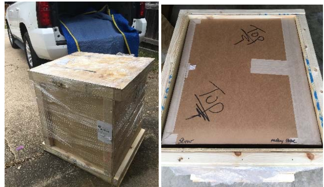
Local transportation home for the tight cardboard box in a sturdy crate!