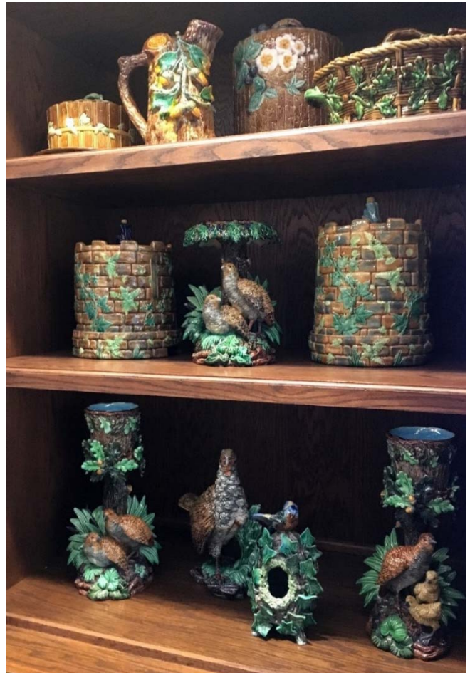
Woodsy and warm, Lonitz with George Jones, Minton and Holdcroft