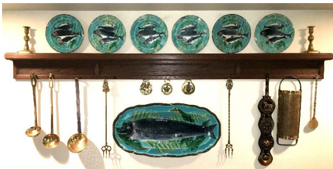
Wedgwood Salmon Platter and side dishes displayed with antique cooking utensils etc. in the kitchen