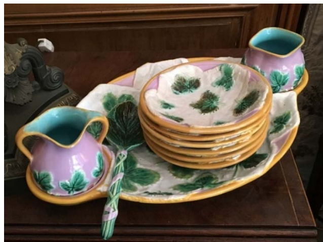
We found this George Jones strawberry and napkin set, complete with the side dishes and spoon in Tom Stansbury's first shop...Dreadful to pass it up! We had never seen all the parts assembled like this!

When we arrived at Tom's main shop, there was majolica in the window which is always a good sign! I immediately spotted a George Jones orchid pitcher which set off my radar. I have two in my collection and I hoped that this was the third size. In any case, if it were a duplicate, I could offer it to a client from my shop. Again, we saw many desirable pieces of antique ceramics and lots of decorative wall brackets and furniture...we could have filled a container to ship back to Texas but...again, it was our first day and we were due to be in Carlsbad Beach at the Witch Creek Winery for the kick off dinner for with family at 6:00 p.m.