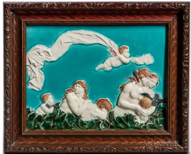
Wedgwood majolica tile, England, c. 1865

Description: Wedgwood Majolica Tile, England, c. 1865, rectangular, with polychrome molded depiction of Neoclassical figures after Clodion, impressed mark, 7 5/8 x 10 1/8 in.; set in a later wood frame.