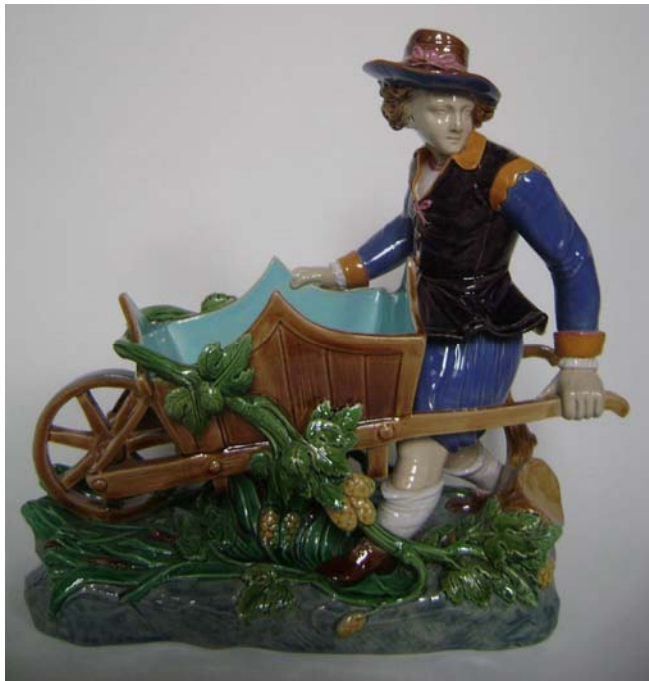
Minton harvester by Jean-Baptiste Jules Klagmann: Harvester pushing a realistically modeled wheelbarrow, his head turned to one side, wearing a broad-brimmed hat. Costume colored in blue, aubergine, yellow and pink. The shape number #418 and date cypher for 1866, size 12 ½ x 12 inches

English majolica was developed at Minton around 1849 by Léon Arnoux, and examples were included in the factory's stand at the Great Exhibition of 1851. From the