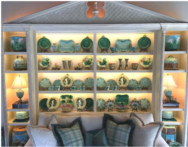
The living room shelves are focused on aqua starting with the garden seats, cheese domes, matching George Jones lamps, candle sticks, baskets, mugs...so much variety, including the very rare Minton yellow Japonism jardinières featured in the recent Architectural Digest article...a luscious display!