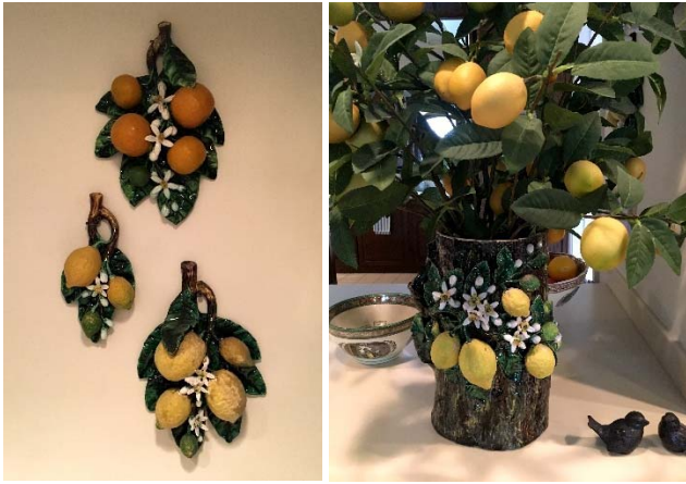
Maryanne's kitchen displays trompe l'oeil pieces by Menton from the Côte d'Azure...very fitting for someone who grows huge lemons just outside her windows