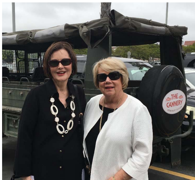
In the parking lot of the Cannery they had a fun "beach" jeep the girls wanted to ride in!