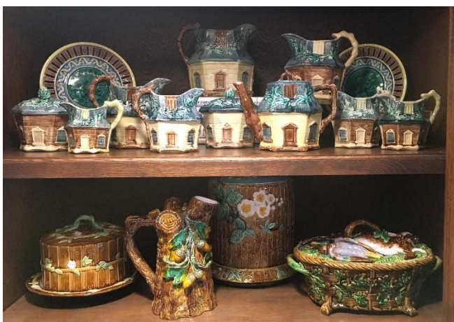
A great grouping of cottage pieces by Warrilow and Cope, including the super large size which was sitting on the floor, used for magazines