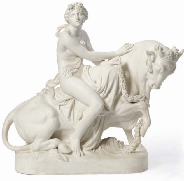
Europa and Bull, Shape 415, Minton, circa 1863, as a nude classical goddess on the back of a bull garlanded with flowers, impressed mark and year mark for 1863, 41.5cm high