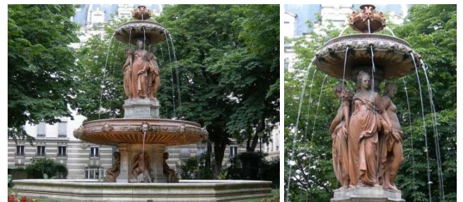
Today's Square Louvois fountain has a simplified base