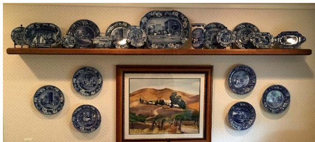
This bedroom and bath were decorated with Dr. Syntax china (a comic character created by William Combe, comic writer (1742-1823) and the cartoonist Thomas Rowlandson (1756-1827). Their illustrations were used as transfers on early English china.