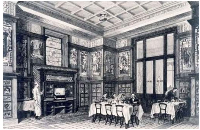
Original 1876 Drawing of the V&A Grillroom