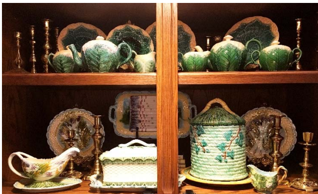
Wedgwood Cauliflower pieces, French asparagus, a wonderful cheese dome, a small sauce dish, a covered box and brass candlesticks to add diversity.