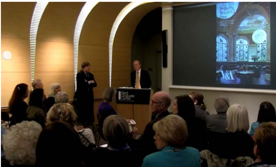
The BARD 2017 was well attended with a packed auditorium and the BARD website has had 139 views of the presentation as captured on YouTube at: https://www.youtube.com/watch?v=cgeLXh4FYpI

Convention 2017 BOSTON, MA in the FALL OCTOBER 5 th thru 8 th , 2017