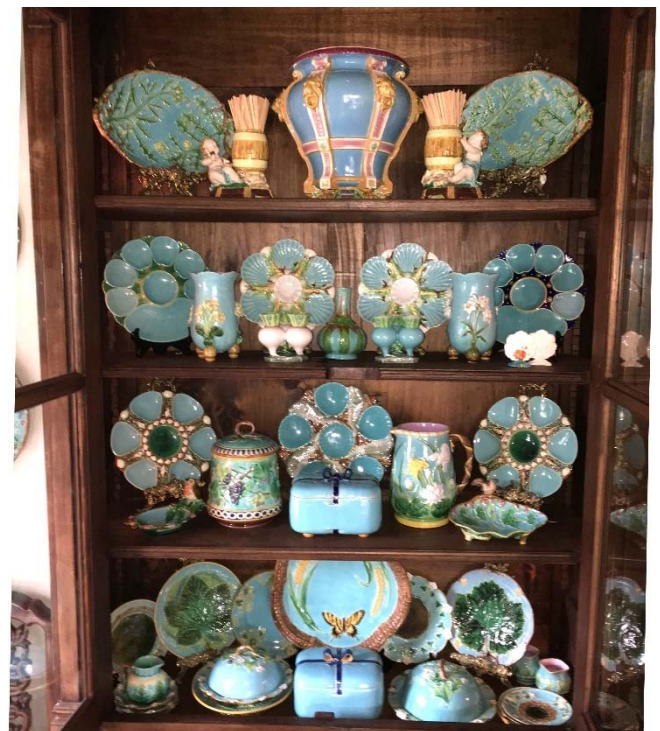
A California girl must have oyster plates but there is so many more pieces large and small...George Jones, Wedgwood and Minton.