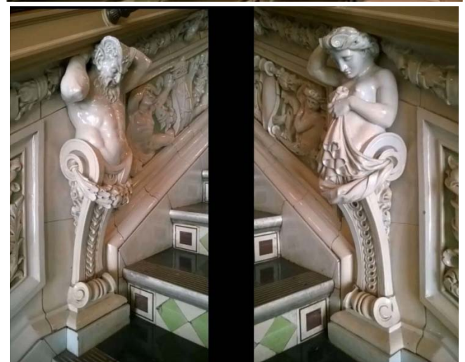
Interior of the V & A, Staircase details