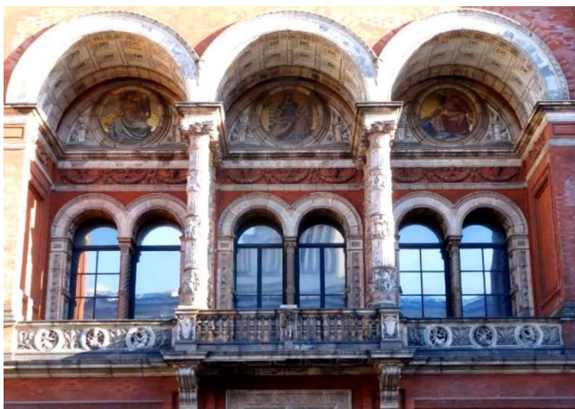
Exterior of the V & A, majolica highlights