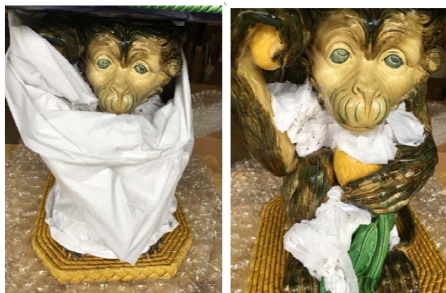
Then a whimsical face peeked out from the tissue