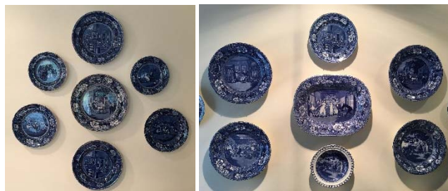
More wall displays of Dr. Syntax Transferware