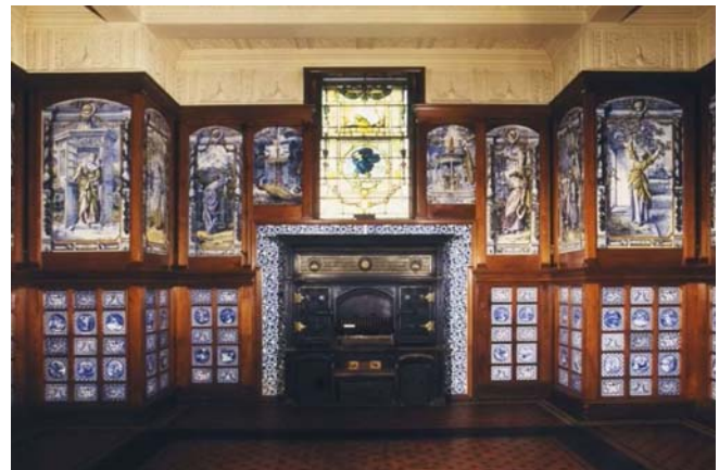
Current state of the V&A Grillroom, majolica tiles