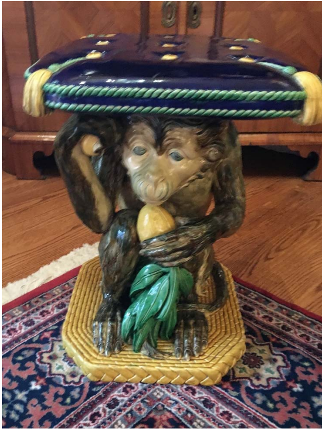
Minton Monkey Garden Seat, shape number 589, c. 1860, 18 1/2" tall, now has a new home in Texas