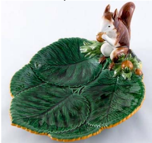
Christian Dior Squirrel with Nut

The online sales listing read as such: Rare large Christian Dior French hand painted barbotine, d 'Onnaing platter featuring a cute squirrel eating a nut in a large leaf with leaves inside. Price: $2,117 plus shipping. In excellent vintage condition. Made in France. length: 9.8 in. x width: 8.2 in Squirrel Height: 4 in. Designer: Christian Dior Period: Mid-20 th Century