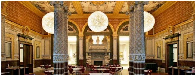
Interior of the V & A, majolica highlights