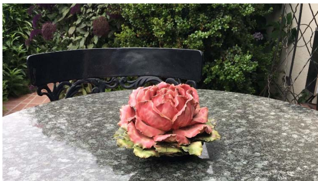
A French majolica rose near the roses in her garden