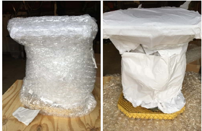
Layers of bubble wrap covered a layer of fresh tissue