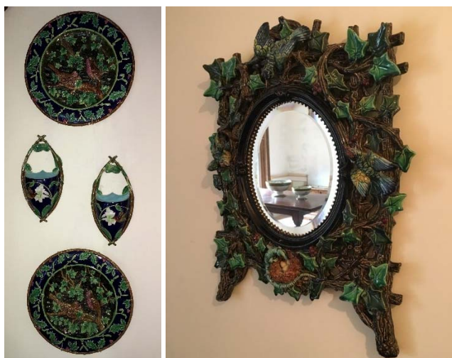
On the left are two George Jones Christmas chargers and those wonderful wall pockets. On the right is that yummy Lonitz mirror with birds and nest.