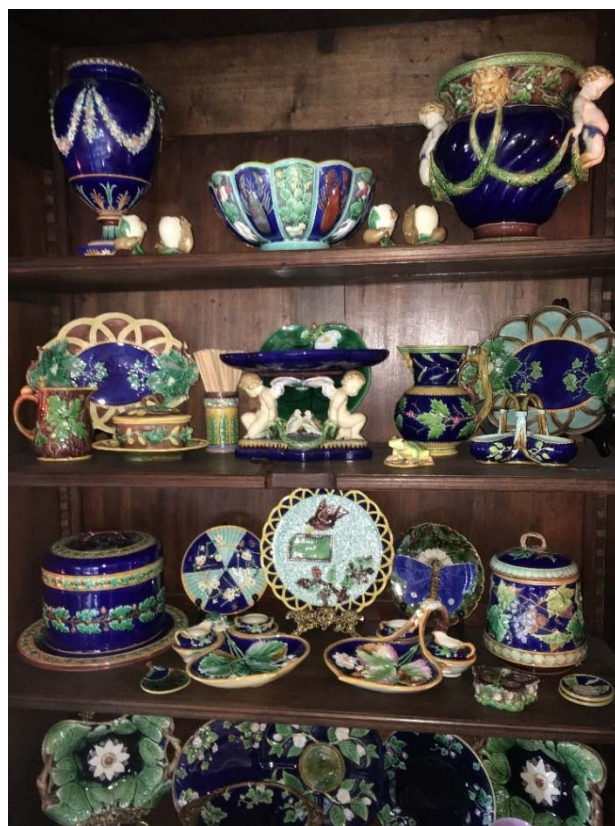
In this grouping of mostly cobalt pieces there are two pairs of tiny mice pieces on the top shelf and lots of other small pieces adding diversity. Butter pats, one a Holdcroft fan pat and two English pats lie on the shelf. There are pieces by Wedgwood, George Jones, Minton and the American Eureka plate and English waterlily platters on the bottom shelf.