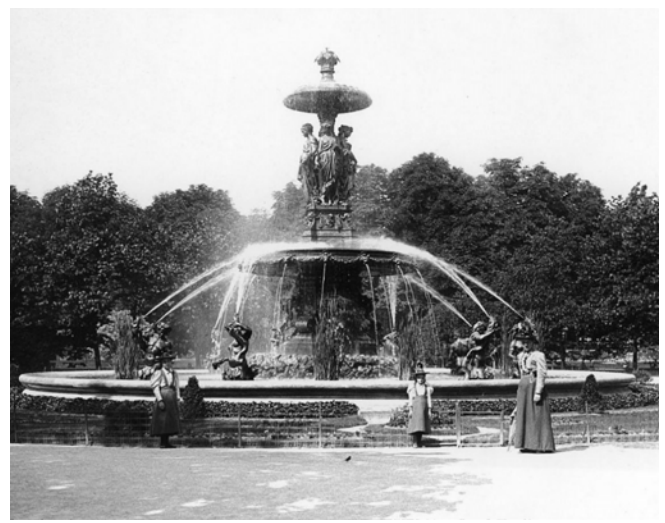
Early photo of the original Square Louvois fountain, and it was restored in 1859, 1874, and 1974

Jean-Baptiste-Jules Klagmann, (April 1st, 1810 – January 18th, 1867 Paris) was a French sculptor. The statues of the monumental fountain in Square Louvois, are the best testimonial example of his work. Facing the Main entrance of the France National Library in Paris, the fountain was built between 1836 and 1839 during the reign of King Louis-Philippe.