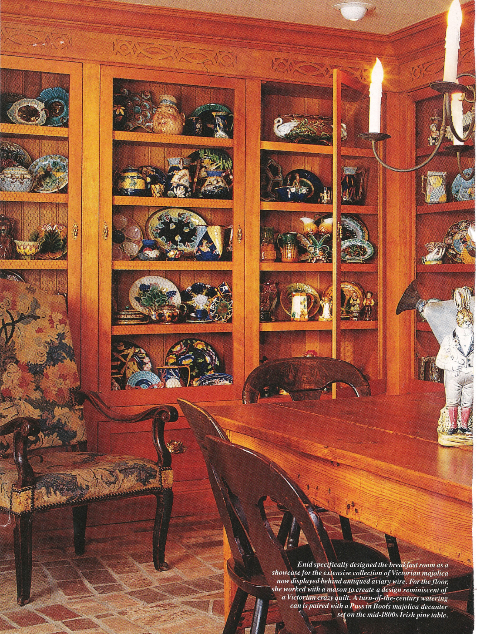
Enid specifically designed the breakfast room as a showcase for the extensive collection of Victorian majolica now displayed behind antiqued aviary wire. For the floor, she worked with a mason to create a design reminiscent of a Victorian crazy quilt. A turn-of-the-century watering can is paired with a Puss in Boots majolica decanter set on the mid-1800s Irish pine table.