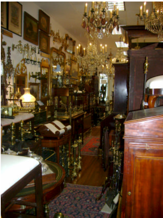
Charleston's shops and galleries on High Street made for excellent shopping