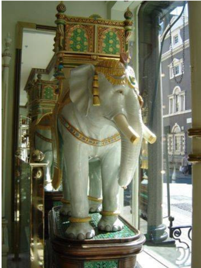
Thomas Goode's window display London