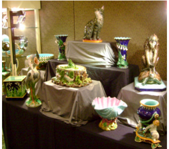
Frogs, Cranes, Cats and Monkeys abound