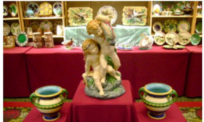
Putti could be found at Majolica Heaven