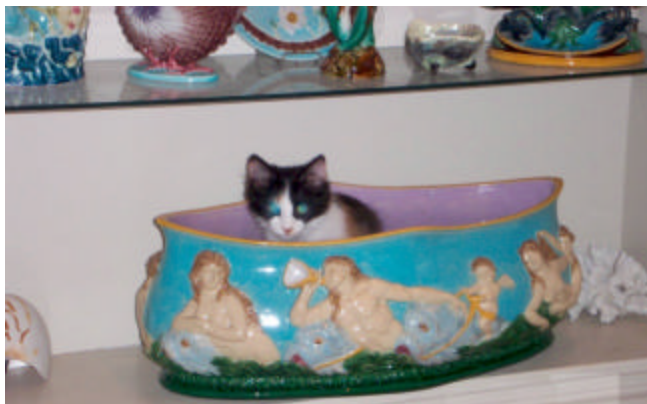
Cally, Pam's kitten, likes to be cool in this awesome wine cooler

Thank you Pam, for sharing your beautiful collection in such an intimate way! We actually felt like we were on a guided tour of your wonderful home.