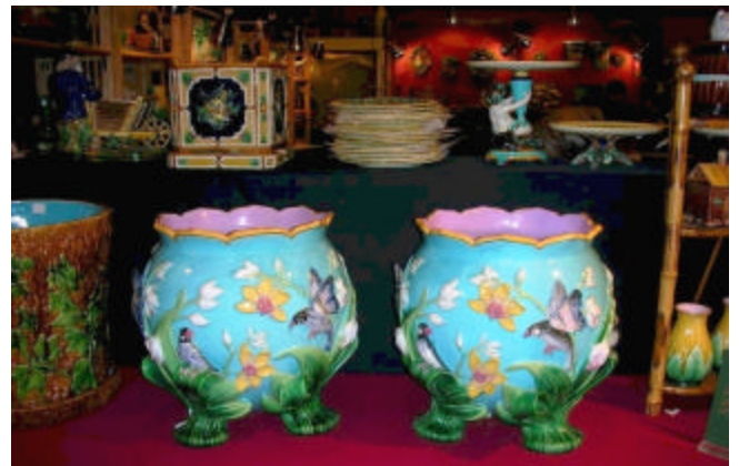
Two is always better than one!