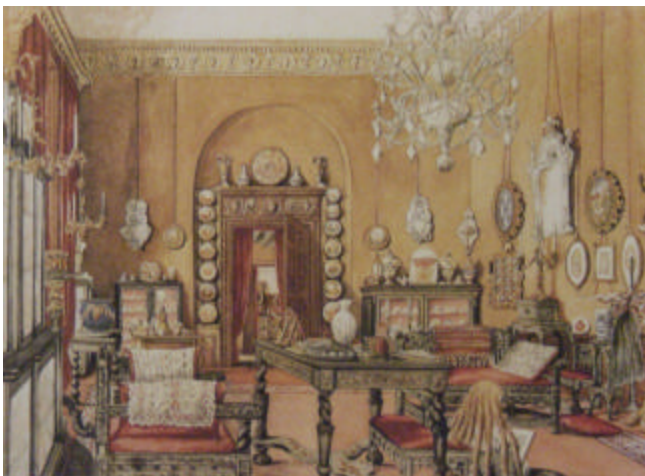
Horton Hall near Bradford