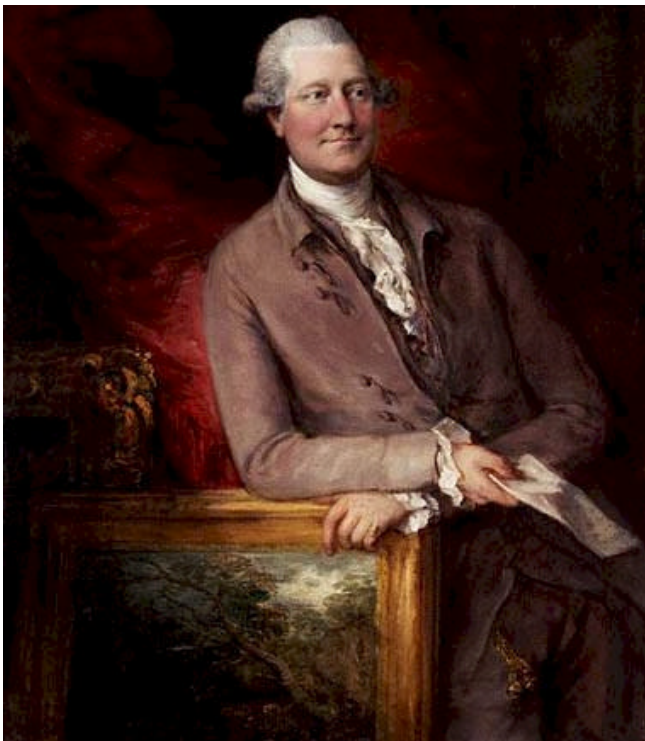
Portrait of James Christie by Thomas Gainsborough The original now at the Getty Museum, Los Angeles