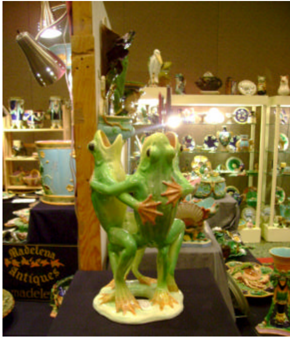
Frogs celebrating at Majolica Heaven