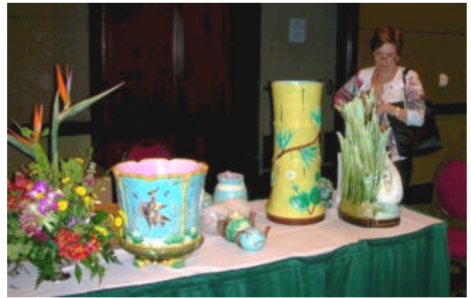
Study . . . Study . . . Study