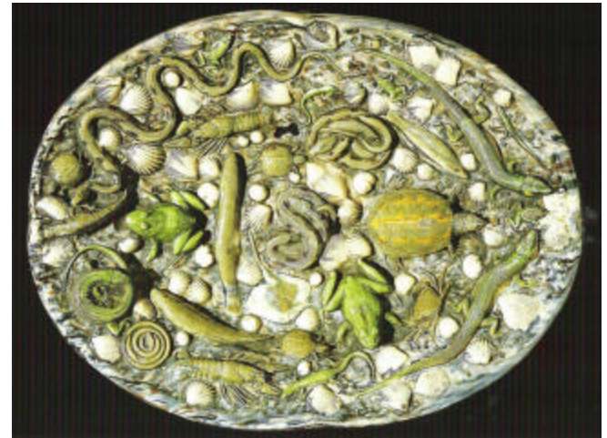
Bernard Palissy - Platter