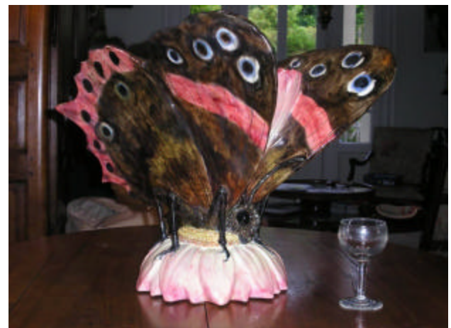
Massier Butterfly Jardinière, dwarfs a wine glass