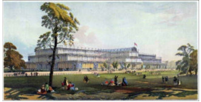
Our Tour Started at the Crystal Palace in 1851