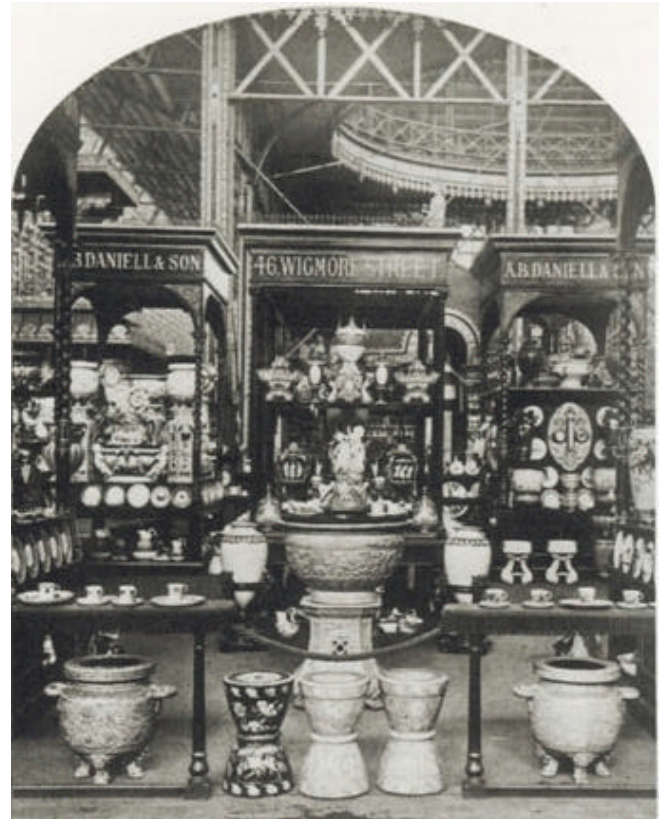
Minton Exhibit - 1876 Philadelphia Exhibition