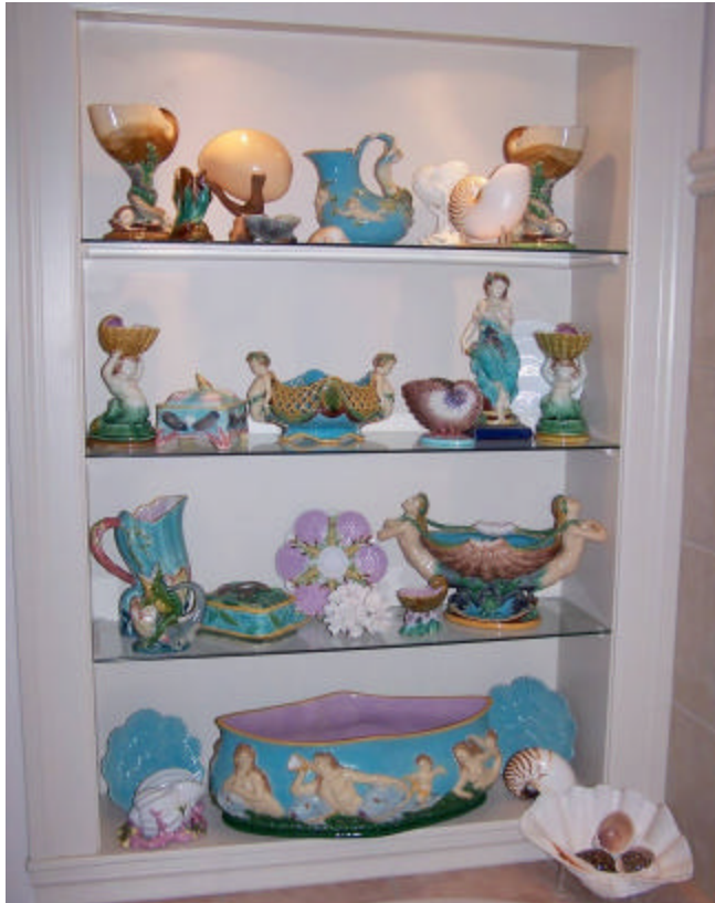
This dramatic shelf holds many of Pam's treasures