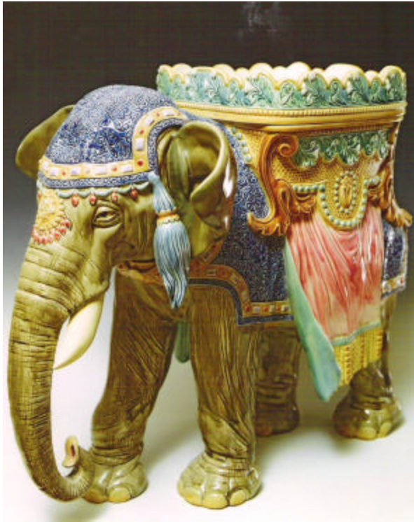
Outstanding detail in this Choisy-le-Roi Elephant