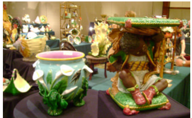
Pieces for your Victorian Garden