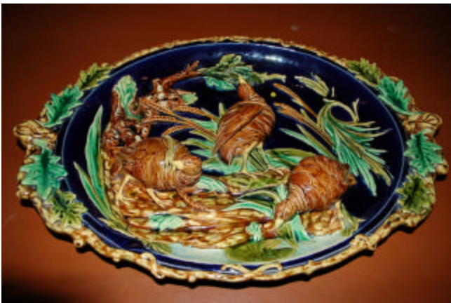
Sarreguemines - high relief quail platter