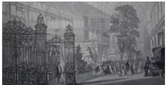
Coalbrookdale Gates & Fountain

In case we should stray and loose our way, Melissa asked us to meet back at the fountain by the Coalbrookdale gates. Note this is not the massive