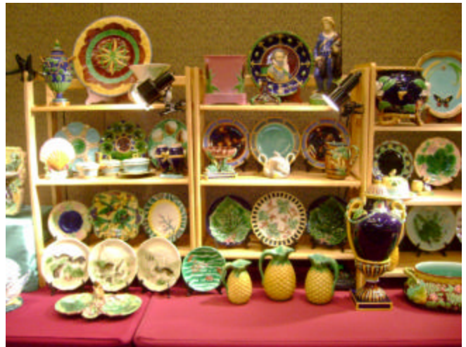
A heavenly display for all tastes!

Convention 2007 was perfect! Thanks to all who helped with the organizing and planning!