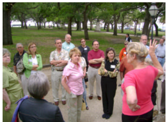
Our guided bus tour included a stroll in Charleston's Battery Park