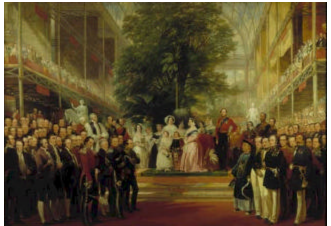
Opening day: The official painting of the ceremony, by H.C. Selous. The Queen, the Prince Consort, the Prince of Wales (in Highland dress), the Duchess of Kent and other members of the Royal Family.