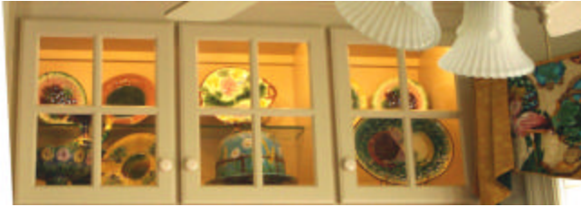
Pam's kitchen cabinet also showcase their collection

grime could be removed and the items condition dramatically improved by Pam's careful cleaning.