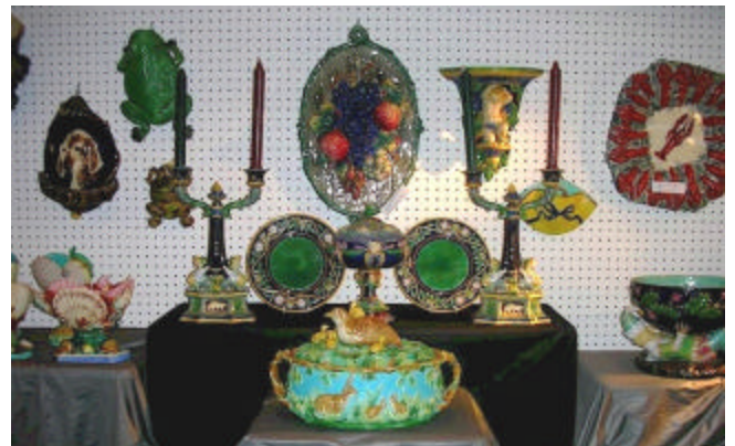
Some items just belong on a book cover! Right Joan?