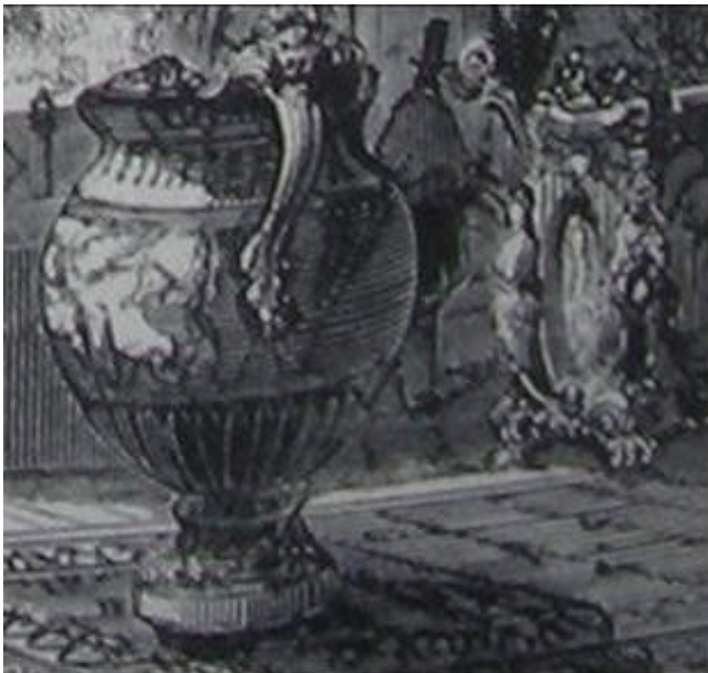
Majolica Urns at the Coalbrookdale Gates